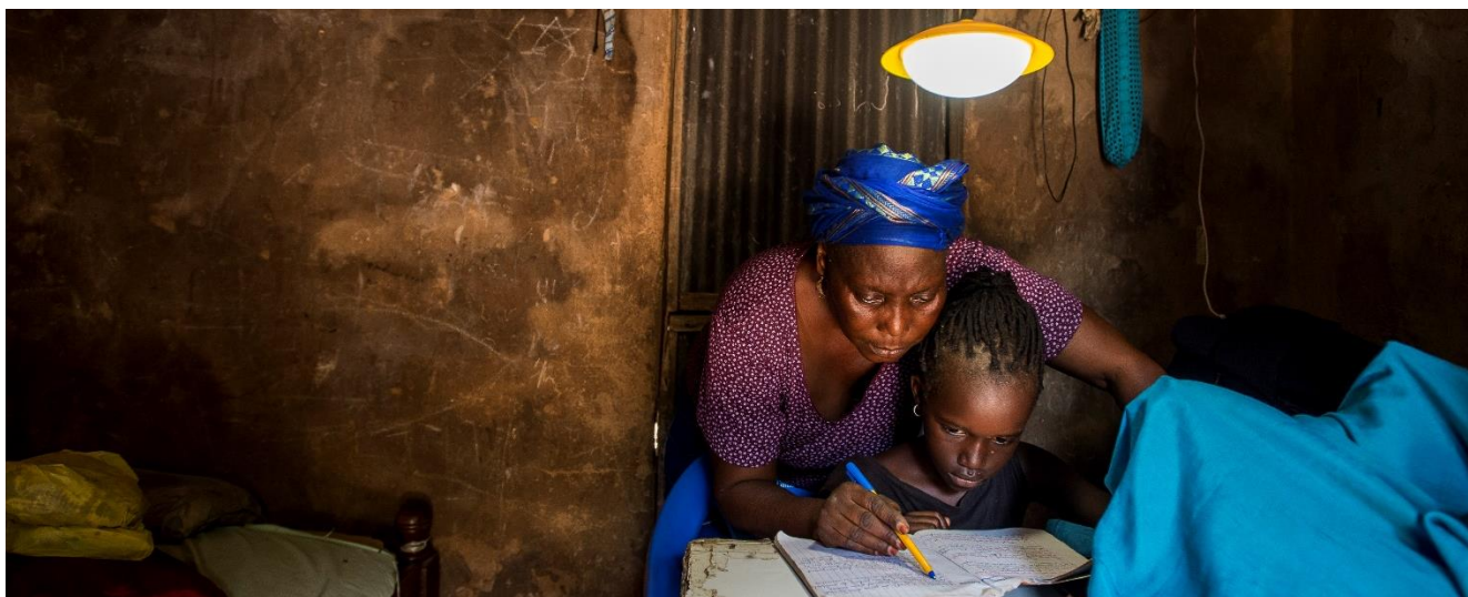
A mother helps her daughter with homework in rural Senegal with help from the light from a solar home system.