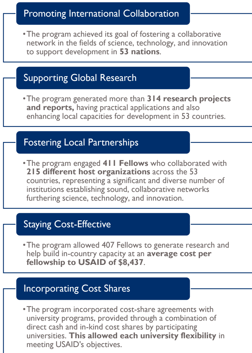
Figure 2: Key Takeaways from This Review

However, as seen in Figure 2, the program did achieve its overarching goal of utilizing early-career individuals, mostly graduate students, to leverage science, technology, and innovation to address development issues and to build collaborative partnerships in developing countries. Moreover, the three program objectives of building a collaborative network between Fellows and host organizations, bringing in third-party stakeholders, and publicizing the project collaborations in country were all achieved.