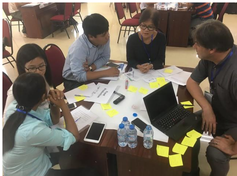
Figure 5. RIFA Fellows at a Workshop

Capacity Building. The RI Fellowship Program sought to build research and development capacities. The program's Fellows worked with 215 different host organizations, where they were able to conduct a wide range of activities, including applied research, establishing relationships with international researchers, participating in community meetings, presenting project findings, and preparing publications. This work allowed Fellows to exchange knowledge and research techniques with their host counterparts, thereby building research capacities. Fellows also built capacities with third-party stakeholders, such as local farmers, by meeting with them directly, learning about problems firsthand, and assisting them in applying the products of their research directly in the field. Thus, knowledge was not only created, it was transferred directly to in-country researchers and in many cases to third-party stakeholders.