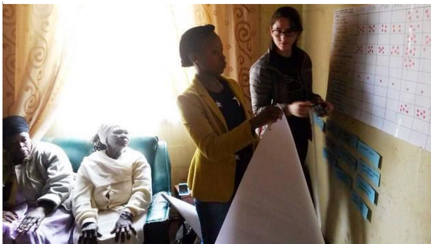
Figure 6. RIFA Fellow with SaveAct in South Africa

Outcomes. The analysis showed that over the course of four years, 411 Fellows completed research in 53 different developing countries where they worked with 215 different host organizations. The work undertaken by the Fellows generated 314 separate project reports detailing the research that was completed and, in most cases, the practical applications for furthering development.