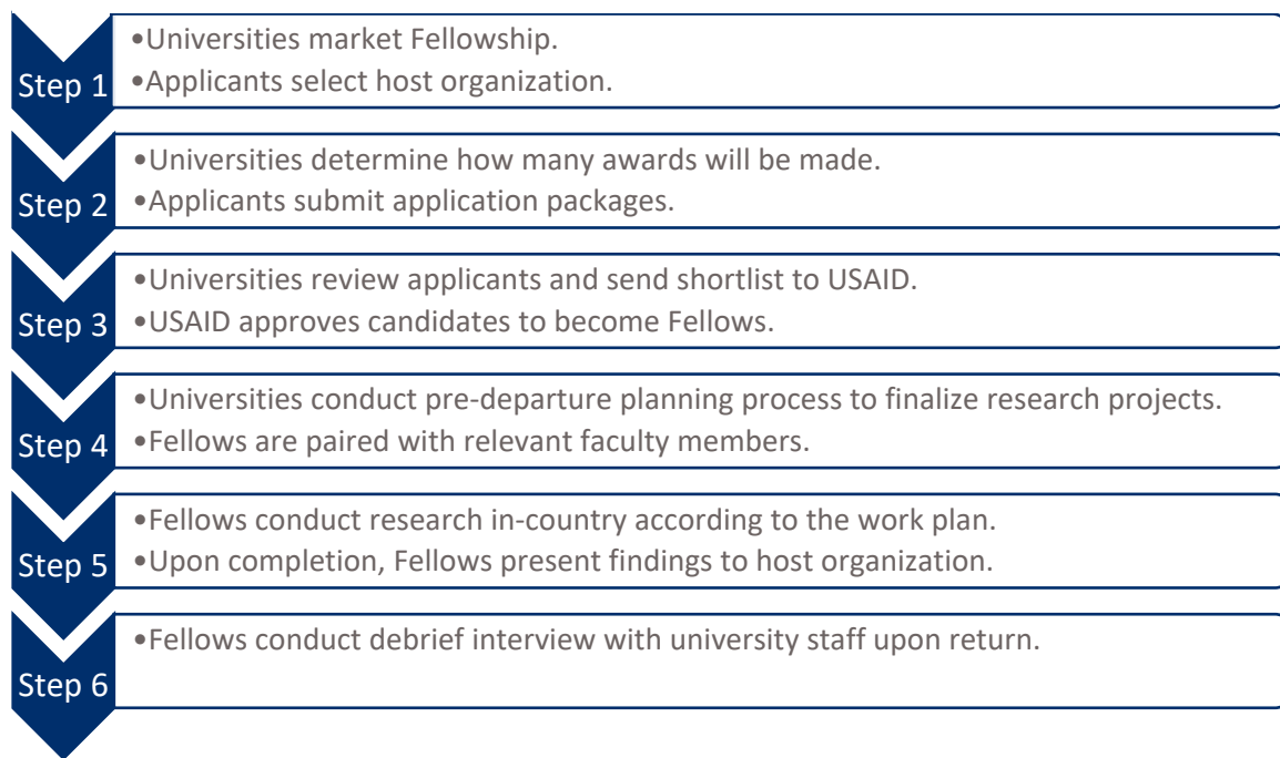
Figure 3: General Overview of the Fellowship Process