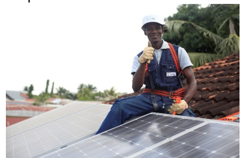
At an S-TEL office in Abidjan, a solar home system is being installed.

Expanding Cross-Sectoral Integration. To support the growth of energy-agriculture projects and products in Côte d'Ivoire, PAOP focuses on helping off-grid companies develop productive use applications of their products and collaborating with relevant USAID projects and partners.