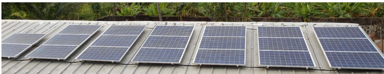
Solar energy systems power Tabou Lighthouse, a region of San Pedro.

The USAID-funded Power Africa Off-grid Project (PAOP) provides technical assistance and targeted grant funding to support the development of Africa's off-grid SHS and mini-grid sectors. Through a team of resident technical advisors across East and West Africa, PAOP works with companies, investors, and governments to advance the role of the private sector in extending energy access while integrating gender considerations into all its work streams.