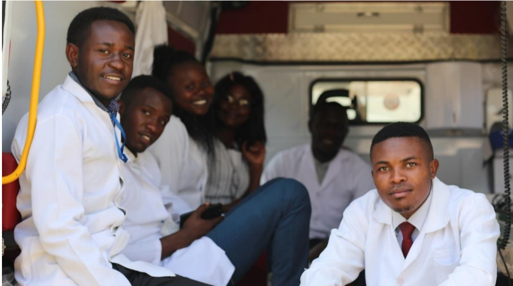
Photo: Medical students wait in an ambulance before the launch of the official handover of the solar plant facility at Kasanda Clinic in Kabwe.