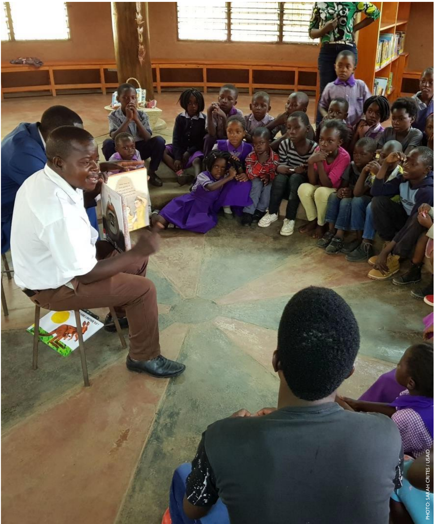
Photo: Students gather around their teacher while visiting the Lubuto Library in Mthunzi Center, Lusaka. Supported by USAID's Office of American Schools and Hospitals Abroad, Lubuto Library Partners builds the capacity of public libraries to create opportunities for equitable education and poverty reduction, and increases access to quality education for marginalized and out-of-school children.