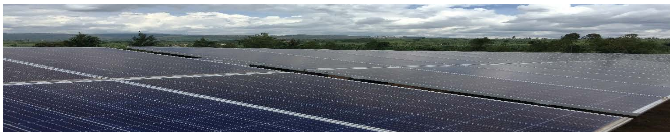
A field of solar panels provided by Absolute Energy, a PAOP partner, helps to power a rural community in Rwanda.

The USAID-funded Power Africa Off-grid Project (PAOP) provides technical assistance and targeted grant funding to support the development of Africa's off-grid SHS and mini-grid sectors. Through a team of resident technical advisors across East and West Africa, PAOP works with companies, investors, and governments to advance the role of the private sector in extending energy access while integrating gender considerations into all its work streams.