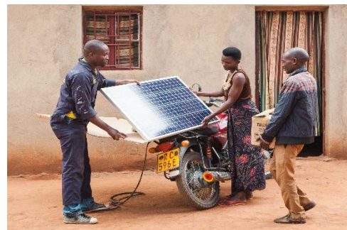
With partners like Mobisol, PAOP helps bring off-grid power solutions, such as SHS, to families.

Expanding Cross-Sectoral Integration. To support the growth of cross-sectoral energy projects in Rwanda, PAOP is collaborating with USAID and other donor programs in sectors such as agriculture, health, water, and education. In addition, PAOP is engaging private sector