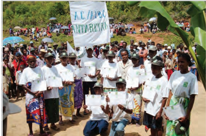
The Commune Mendrika (Progressive Communes) program rewarded communities that made significant progress toward environment, health, governance, and economic goals.

skills to manage their internal affairs, raise and properly use tax funds, and lobby government authorities to address critical problems (e.g., road washouts). This was beginning to have some positive results. The EP III “Commune Mendrika” program focused on commune level planning and interventions, with rewards for good governance and other achievements. MISONGA began to get promising results with its mentoring program for female commune mayors.