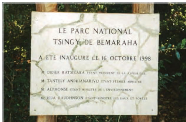
Madagascar has made enormous progress in establishing and funding its national parks since the NEAP was launched. In 2003, President Ravalomanana committed to putting 10% of the country’s land under protected area status.

All of these spatial analyses were (unbeknownst to some of the participants) leading up to Durban 2003. In the months leading up to the IUCN Worlds Parks Conference, the conservation triumvirate worked with President Ravalomanana and the DEF Director to prepare Madagascar’s commitment to allocate 10% of its territory to protected areas status. This would put Madagascar in compliance with the IUCN global goal established in Brazil a decade earlier. When President Ravalomanana