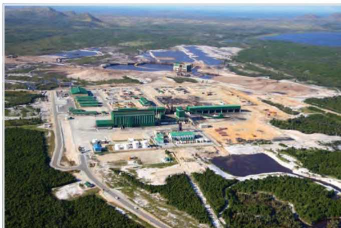
The arrival of multinational mining companies (here a photo of Rio Tinto's operations near Fort Dauphin) adds new challenges to environmental conservation in Madagascar.

Concern about the effects of climate change on Madagascar's biodiversity and livelihoods motivated the organization of the 2008 Climate Change workshop in Antananarivo. USAID and its partners (among them CI and WWF) played a key role in helping the GoM to organize the workshop with MacArthur Foundation support. The U.S. Ambassador was a keynote speaker. More than 130 experts participated, some bringing experiences from Madagascar, while others used sophisticated models to predict the likely effects of climate change on different species and eco-systems.