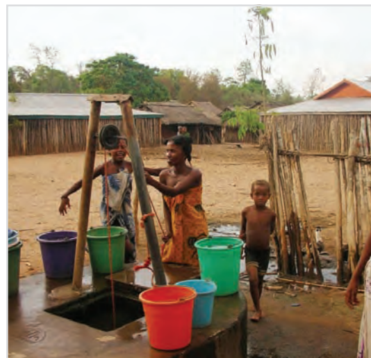
This Menabe photo shows the well built with PES funds in Tsitakabasia in return for villager protection of forest resources.

Avoided deforestation. In general, the focus in Madagascar has been on avoiding deforestation (keeping existing forests intact), rather than reforestation or afforestation (although CI is currently doing some reforestation of forest corridors in Zahamena), largely because the fundamental environmental concern is biodiversity, rather than merely “greening” the country. This has complicated PES implementation because avoiding deforestation was not, in