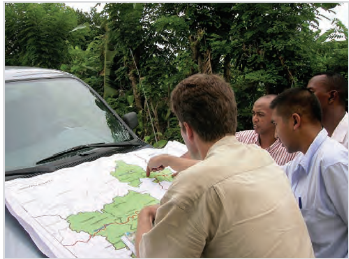
Protected areas under the new SAPM system will be zoned into various categories, approximately half of which will involve some degree of co-management with either local communities or private operators. Some KoloAla (production forest sites) will be within the protected areas, while others may be defined outside the protected area system.

For sustainable harvesting to work, it is critical that "legitimate" forest products be differentiated from those that have been harvested illegally since it is more expensive to harvest sustainably and illegal products engender unfair competition. The "chain of custody" model (a series of procedural reforms, accompanied by a new wood marking system, computer monitoring software, and training) developed by DEF and Jariala at least theoretically enables forest products to be tracked from place of origin to final use. If legally adopted and applied, this tool will be a powerful addition to the forest management arsenal.