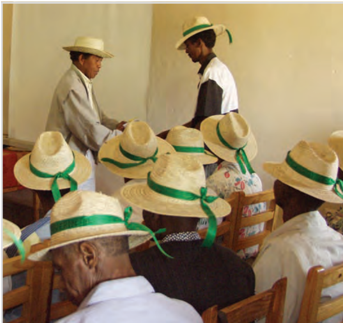
The KoloHarena Farmers movement has been one of the most successful civil society interventions implemented under USAID projects. As the association has grown and matured, however, some of the environmental focus has dissipated. Here community extension agents receive certificates honoring their work.

It is interesting that the civil society movement that may be the most well established among those mentored under USAID projects is the KoloHarena farmers movement. 118 Initially, the KoloHarena associations had a strong environmental focus. The target population was the farmers living immediately adjacent to the USAID priority forest corridors. In return for agreeing to forego tavy , farmers who joined the association were eligible for credit and other project assistance to help them undertake alternative agricultural and livelihood ventures. The movement has gained strength over the years as it has responded to the practical needs of its members (e.g. running remote agricultural supply centers and helping farmers connect to buyers for commercial crops). KoloHarena effectiveness has been greatly enhanced by their access to the ham radio communications system that the projects installed in communities along the forest corridors.