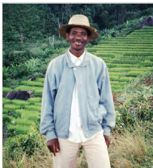
Intensifying rice production (here a farmer in the Ranomafana corridor has adopted some of the SRI recommendations) can help to reduce pressures on the forest but increased revenues can also give farmers the means to hire labor to make additional tavy fields.

Alternatives to tavy. Numerous technical approaches were essayed with varying degrees of success. In EP I much attention was focused on the valley rice-growing areas where it was thought that substantial increases in yields could significantly reduce farmer interest in tavy . This assumption had several flaws. While there were dramatic improvements in yields (using System of Rice Intensification – SRI 79 techniques) on very small