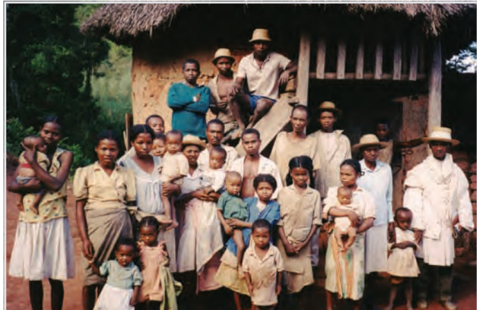
Many of Madagascar’s rural people, as this family who farms next to Andringitra Park, depend on natural resources for their livelihoods. Difficult as it may be, it is imperative that future interventions do even better at incorporating local voices and social justice issues into our treatment of biodiversity issues in Madagascar.

All actors in the next phase of environmental planning should incorporate significant changes in the international context into their analyses. If Madagascar’s environmental profile has risen over the past 25 years, so has interest in its mineral and petroleum riches. Influencing these giant national and multinational industries will require different strategies from those employed in previous environmental programs.