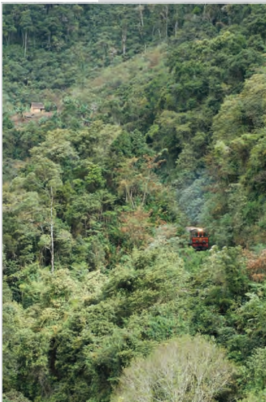
Saving the Fianarantsoa forest corridor depends in large measure on saving this train line that traverses the corridor. The FCE railway debacle sadly illustrates how bad governance can sabotage economic and environmental progress.

The issues raised here are by no means unique to Madagascar; though Madagascar's governance problems are profound and persistent. The fact that other countries face similar issues is not much consolation, however; unless we can show that those countries have made rapid and significant progress on economic and environment indicators in spite of governance weakness. In Madagascar, we are left with the question of whether progress on environmental issues can take place in the context of a State which may not want to be reformed and may not have a true commitment to sustainably managing its environment. At a minimum that conclusion would beg a change in the "benign state" approach employed by donors over the past quarter century.