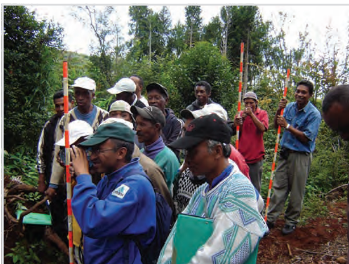
Capacity building of national environmental management structures has been a pillar of USAID's program in Madagascar since EP I. In this picture, foresters practice techniques necessary for forest zoning.

Under EP I, U.S. institutional efforts were focused on creating ONE and ANGAP, while the World Bank put resources into DEF capacity building through the Forest Management Project. 44 The Debt-for-Nature project did train a cadre of some 400 nature protection agents at the local level. These people, recruited primarily from the rural areas where they lived, did not have enforcement power. Instead, they acted as liaisons with the forestry service for environmental education and "dissuasion" of illegal activities. Debt for Nature also helped to construct some DEF offices, provide uniforms, and otherwise increase the professionalism of the forest service.