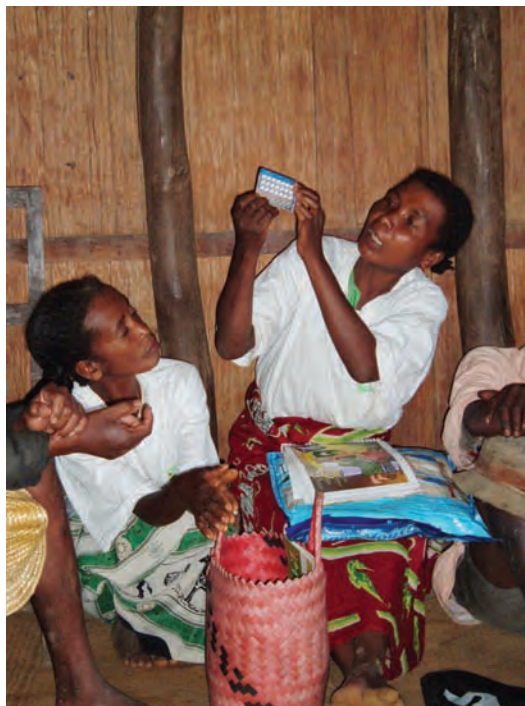
The integration of health, family planning, and environmental programs in priority conservation areas has been an important feature of USAID’s Madagascar program. In this photo, a family planning demonstration in Tsaratanana, in the Ranomafana-Andringitra corridor.

Partly as a result of working together in this remote and challenging context, the vision became more sophisticated. Initially, collaboration grew out of a perceived need to slow population growth that was undermining the ability of environment/rural development projects to achieve per capita improvements (e.g., in rice production) as needed to reduce pressures on natural resources. As such, the early focus was on getting contraceptives into areas around the Protected Area (PAs) and corridors. By the late 1990s, there was growing recognition that health interventions could play a more significant role in promoting conservation activities. Specifically, it became clear that doing