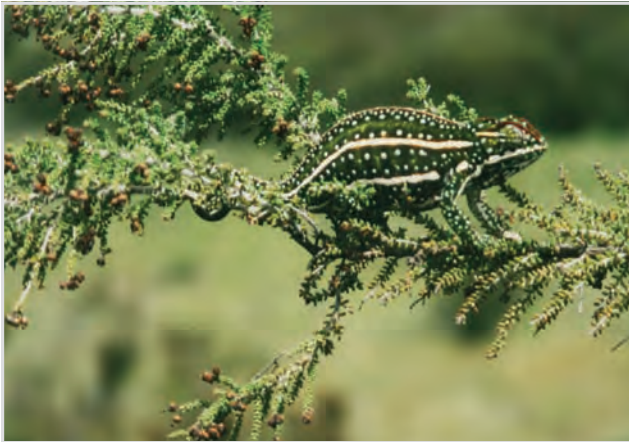
Madagascar's biodiversity is unique: 98% of its mammals, 91% of its reptiles, and 80% of its flowering plants are found nowhere else on earth.

Concerted efforts 2 to save Madagascar's natural forests 3 began in the mid 1980s when Madagascar and its partners began preparing the first Madagascar National Environmental Action Plan (NEAP).