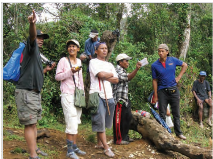
In this photo, COBA members monitor tavy activity at the forest edge. Enforcement of illicit activities within villages has proven difficult due to the need to maintain good social relations. The state rarely backs up COBA enforcement efforts.

The costs of management. Comparison of the costs of enforcing forest policies through DEF or through COBA mechanisms confirm that it is much less expensive to work through the COBAs. One recent set of estimates posited that it costs the COBAs about $.08 to control a hectare of territory as opposed to ANGAP’s local cost of about $5-$8 per hectare to manage a small park (Hockley, 41). These co-management costs underestimate the other inputs needed to make this system sustainable and effective (notably the need to provide some external enforcement and the vulnerability of the co-management system when benefits are not sufficient to maintain community interest), but they are nonetheless telling. Given this advantage,