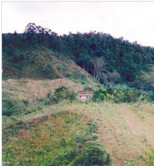
Tavy remains the principal cause of humid forest destruction as forest reserves are transferred into agricultural production zones; this photo from Ambodigavy in the Zahamena forest corridor c. 1998.

As the primary proximate cause of forest conversion in many of the priority biodiversity zones (nationwide estimates suggest that 80-95% of deforestation is caused by agricultural conversion, while the remainder is caused by extraction of wood for fuel or building materials), the PE II and PE III eco-regional projects put enormous effort into persuading farmers to forego the extensive slash-and-burn agricultural production system. 74 While these production systems were sustainable in the past, when the population was small, fertile land was abundant, and 15-year fallows allowed soil fertility to regenerate before land was put back into production, these conditions no longer exist in Madagascar. With fallows that rarely exceed three years, there is rapid deterioration of soil fertility and many lands are more or less abandoned for agriculture after 20-30 years (which equates with fewer than 10 harvests).