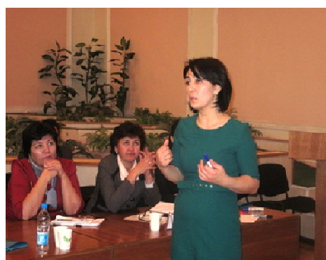
Photo 1-2. Representatives of MIA, "Makhalla Fund", Lawyer of NGO "Istiqbolli Avlod" State Supported Rehabilitation Center at the roundtable delivering a presentation (CT roundtable)