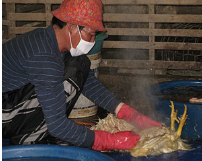
USAID and its partners promote greater awareness of avian influenza among poultry workers in Vietnam