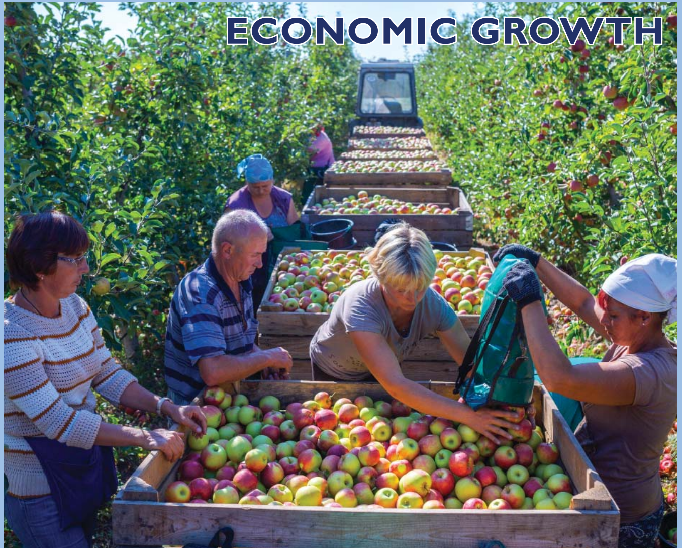
Harvest time at the Sady Donbasu Orchards in Poltavka Village, Donetsk Oblast.