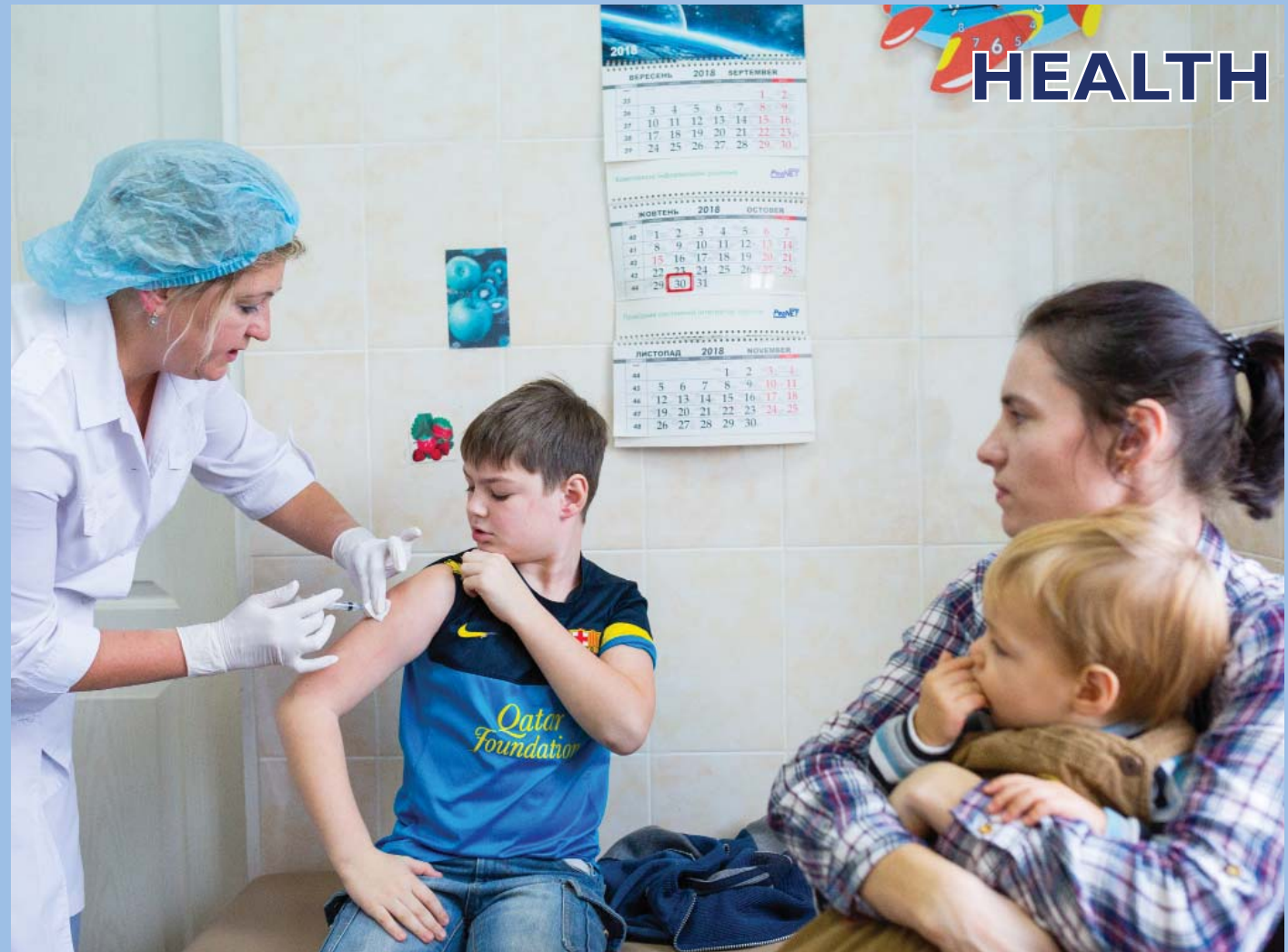
A young boy receiving a vaccination at a primary health care center in Kyiv.

In 2018, USAID provided critical support for health reforms that introduce a transparent and efficient health system and better respond to the needs of Ukrainians. USAID also continued to help Ukraine respond to its high burden of infectious diseases, including HIV/AIDS, viral Hepatitis C, and multi-drug resistant tuberculosis (MDR-TB), and to counter widespread misinformation about immunization.