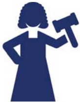
Number of courts that improved their case management systems.