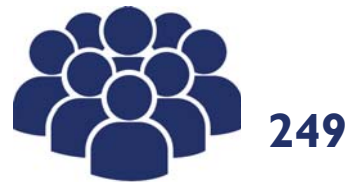
Number of people affiliated with NGOs receiving anti-corruption training.

USAID continued to build the organizational capacity of Ukrainian civil society to become stronger citizen advocates and government watchdogs, as well as assist them to better represent citizens' interests and drive reforms through oversight and advocacy. This support increased the capacity of 87 CSOs to build coalitions, advocate, and monitor government performance, and helped 162 CSOs increase their organizational capacity, contributing to Ukraine's Civil Society Sustainability Index score of 3.2, which remains the highest in the region. A total of 142 CSOs were engaged in advocacy interventions, shaped public agendas, changed public policies, and influenced other processes that impact people's lives. Additionally, 249 CSOs received anti-corruption training. USAID also worked to maintain the