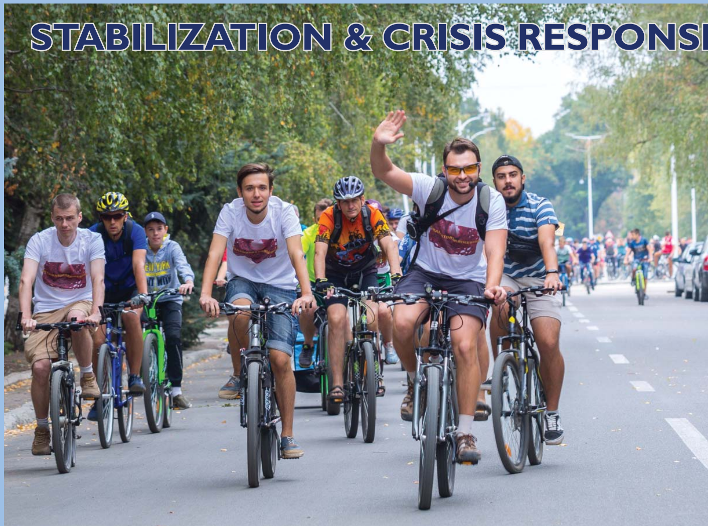
Local activists strengthen their community and promote healthy lifestyles with USAID support by participating in the East Biking Forum in Kramatorsk, Donetsk Oblast.