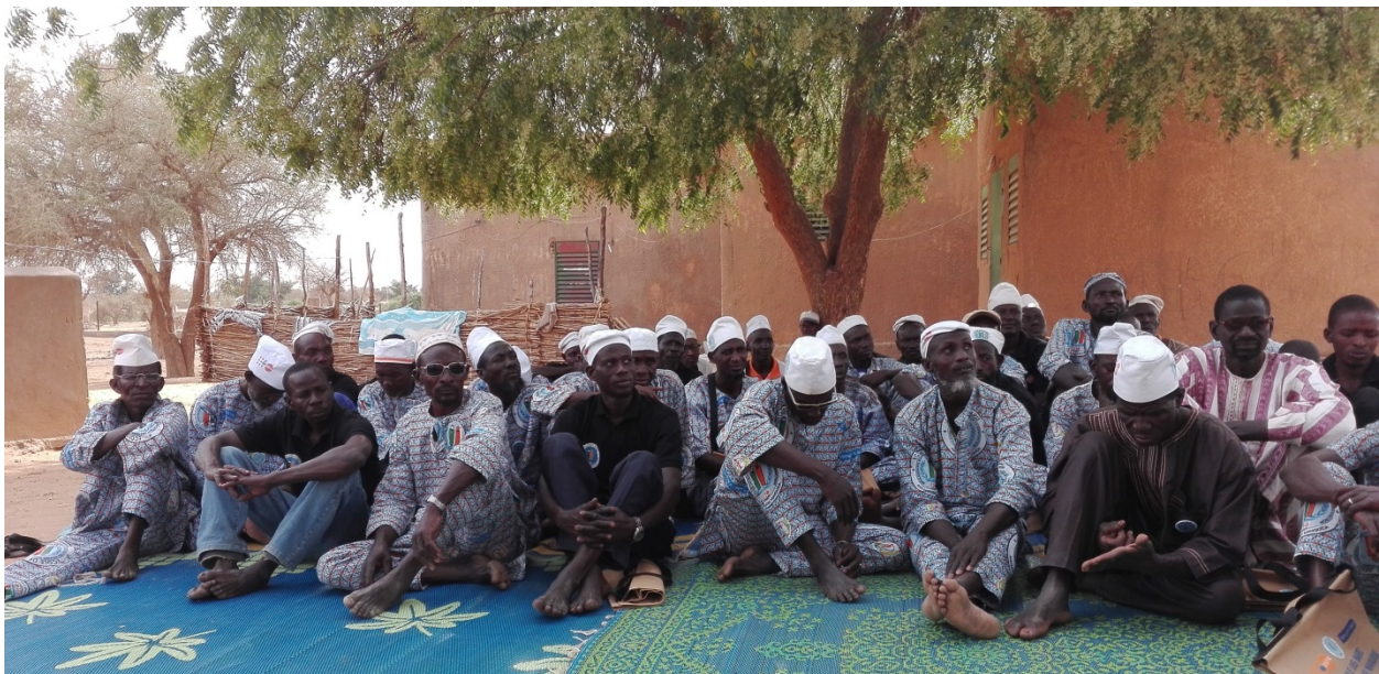
A Husband School in Seno village in Tillaberi Region

Despite deeply entrenched pronatalist attitudes, promising approaches indicate that change in cultural norms is possible. Husband Schools, which were introduced in Niger in 2008, have been shown to be an effective, culturally-appropriate means to engaging men on issues of health and fertility. The Camber Collective recently completed a market segmentation study that provides a more nuanced picture of views on fertility. Meanwhile, recent initiatives to increase access to FP services – including the Gates Funded IMPACT program, the MoH’s introduction of Syanapress at Health Posts and Marie Stopes International (MSI) mobile clinics in the RISE zone – all prove that many women actively seek these services once they become available. A major barrier to increasing FP use appears to be the limited