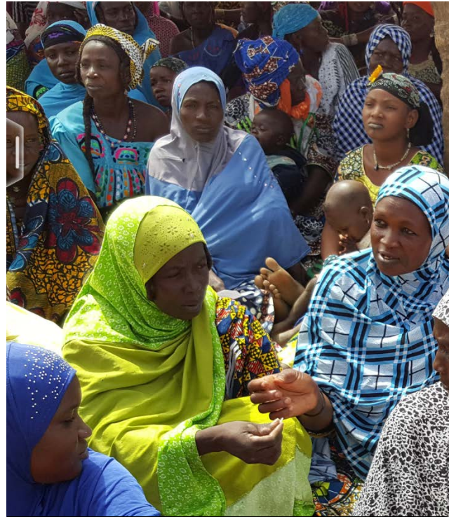
Women in Chileda waiting for FP services provided through a MSI mobile clinic.