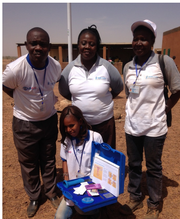
MSI animators from the Kaya Mobile Team.