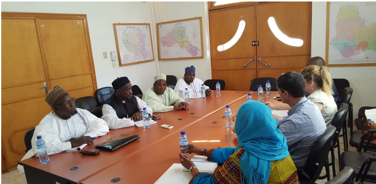
The FP Assessment Team discusses fertility with Islamic leaders in Niamey, Niger.

Following the collection of primary and secondary data in each country, the FP assessment team conducted a thorough analysis of strengths, weaknesses, opportunities and threats related to increasing the use of FP service in the RISE zone. The FP assessment team in consultation with local USAID health staff then identified potential programming options to better leverage existing FP and resilience