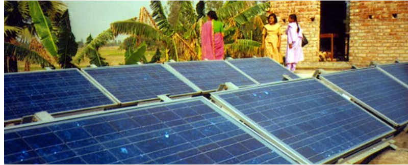
Solar modules installed on the roof of the Satyanarayanpur Health Center in West Bengal, India.

Global technical platforms provide free, state-of-the-art support on common and critical challenges to scaling up advanced energy systems. These platforms, informed by country demand and NREL's domestic and international experience, are universally relevant to