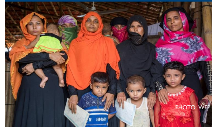
Photo: Rohingya women and their children gather to receive WFP nutrition assistance.