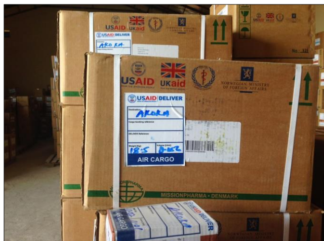
Partners can share and access operational data, such as information about transporting emergency relief commodities, through OCHA's information sharing platforms.

With USAID/OFDA assistance, OCHA is improving information sharing and humanitarian data management through its Humanitarian Data Exchange (HDX) and Humanitarian ID projects. Through HDX, relief agencies are able to upload and download humanitarian data—such as displacement patterns, settlement locations, and assessment results—to better plan activities according to humanitarian needs. Using the Humanitarian ID service, emergency responders can share updated contact details with colleagues and more easily connect with key contacts, such as cluster coordinators or agency leaders. Learn more about HDX and Humanitarian ID at: https://data.hdx.rwllabs.org/ and http://humanitarian.id/ .