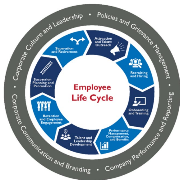
FIGURE I: Employee Life Cycle

The U.S. Agency for International Development (USAID) is committed to both promoting gender equality and women's empowerment and strengthening all workplaces, especially in male-dominated industries where significant equality gaps are observed, in order to fuel economic growth and social development. Through its Engendering Utilities program, USAID identified the employee life cycle as a key entry point to effecting long-lasting and impactful change within partner electricity and water utilities and identified applicability to other industries. From attraction and talent outreach to separation and retirement, there are numerous opportunities to promote gender equality within any workplace.