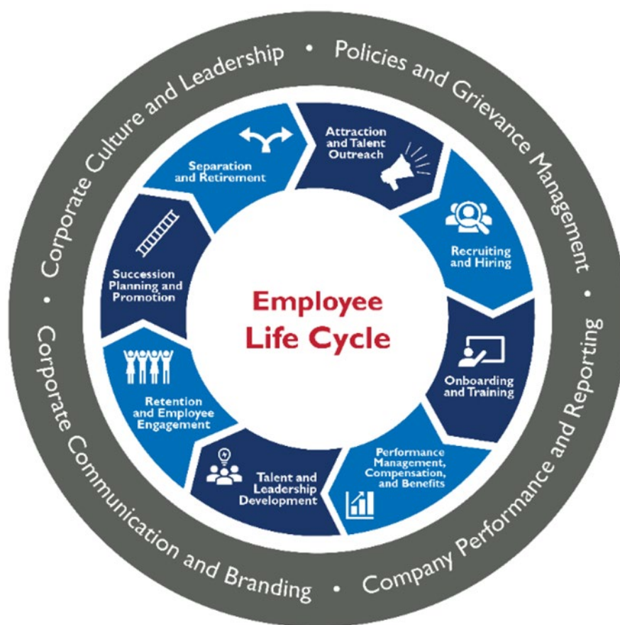
FIGURE 4. Employee Life Cycle

The second layer focuses on Organizational Enablers , which include entry points for gender equality that serve as prerequisites to support interventions within the Employee Life Cycle. These identified organizational enablers are critical, as they may either be success factors or strong hindering factors, and therefore need close attention. These enablers include Company Policies and Grievance Management, Corporate Culture and Leadership Models, Company Performance and Reporting, as well as Corporate Communication and Branding.