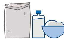
Emergency Food Assistance

USAID partners are providing emergency food assistance for 300,000 people and supporting immediate emergency response activities, including health assistance and distributing hygiene kits to people affected by the explosions.