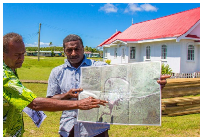
USAID has helped nearly 160 communities in nine Pacific Islands improve infrastructure resilience to natural disasters since 2012.

Relatively new democratic institutions, weak rule of law and nascent civil society undermine the Pacific Islands' capacity to become self-reliant. USAID reinforces the foundations of good governance by encouraging all citizens — including women, youth and other marginalized groups — to participate in democratic processes. USAID also promotes government accountability and transparency by encouraging citizen engagement and implementation of effective policies.