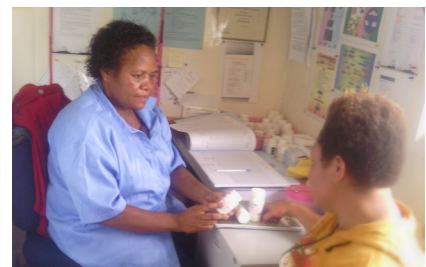
Since 2012, USAID has counseled and screened more than 4,000 Papua New Guineans for HIV and AIDS, sustaining a healthy population.